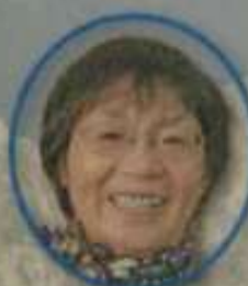
JUNKO Tabei Japan, 1975