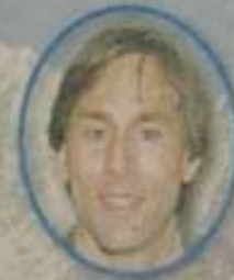
ERIK WEIHENMAYER USA, 2001

For detailed instructions, see inside front cover.