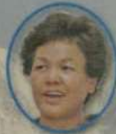
BACHENDRI PAL India, 1984