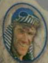
EDMUND HILLARY New Zealand, 1953