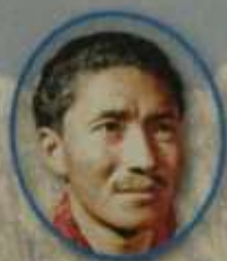
TENZING NORGAY Nepal-India, 1953